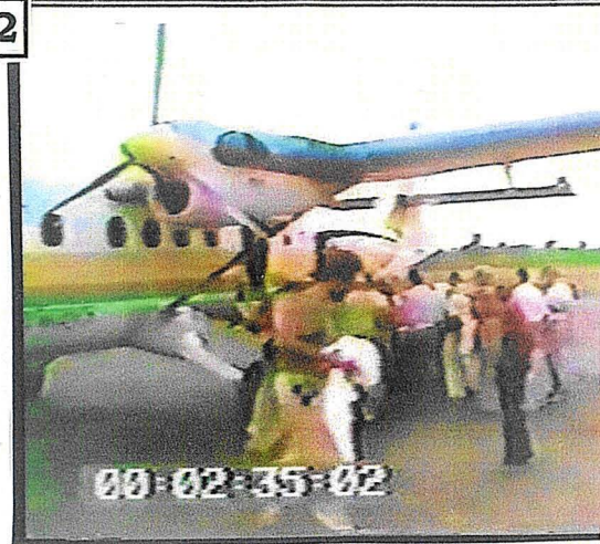
Passengers Amassing Boarding Area on LEFT side of the Plane