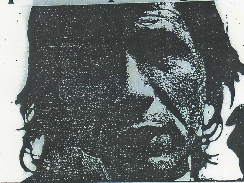
Indian leader Dennis Banks says he was asked to denounce Rev. Jim Jones.