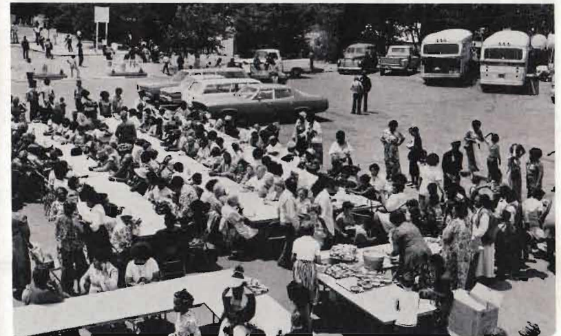
Hundreds gather in Redwood Valley for the traditional July 4th celebration.