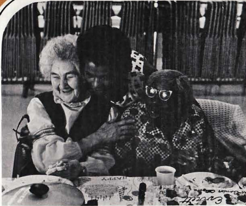
One of the Temple's senior members celebrates her 100th birthday with her friends. The seniors at the Temple are very involved in church activities. They meet regularly to work on various projects and services.