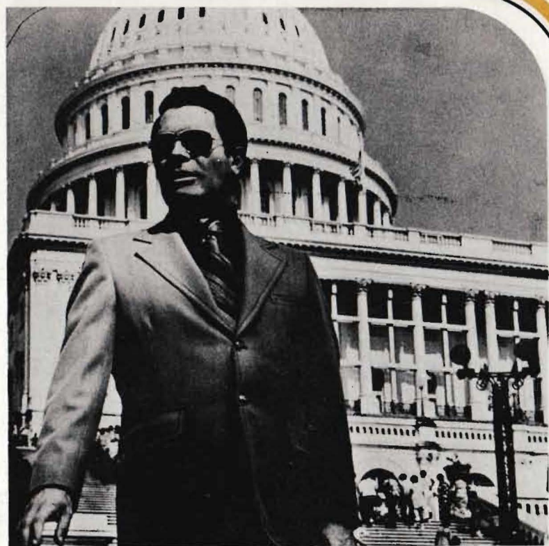
Vacation tour was not complete without a stop at the Capitol building in Washington, D.C., the seat of America's government. Here Pastor Jones and members of Peoples Temple visited with their local Congressional Representatives.