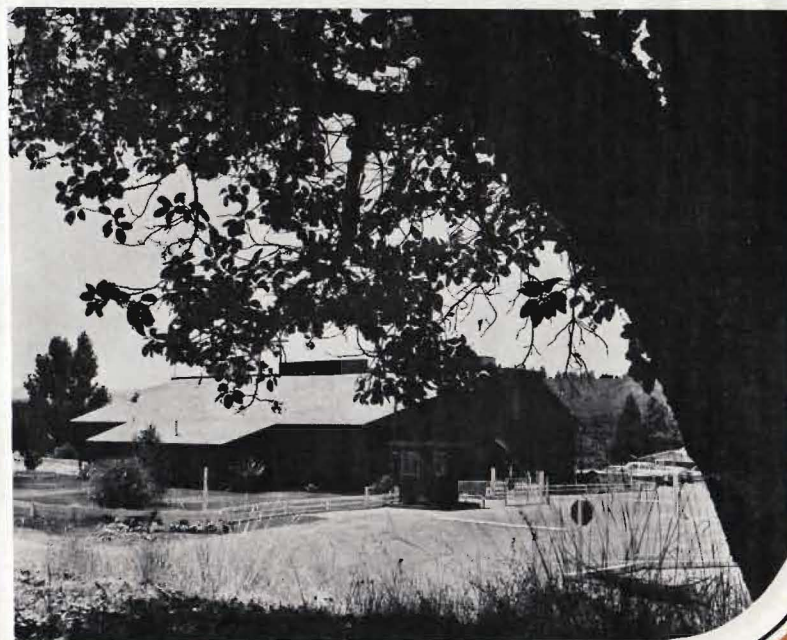
Peoples Temple in Redwood Valley.