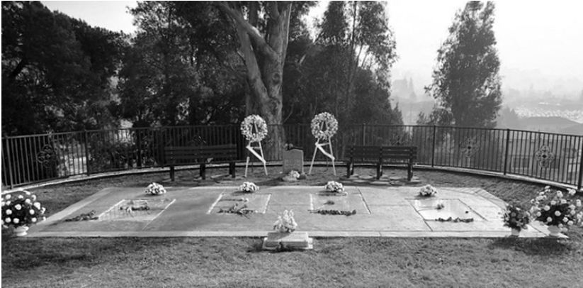
Figure 7 Plaques installed in 2011 and refurbished in 2018 for the fortieth anniversary of the Jonestown deaths.