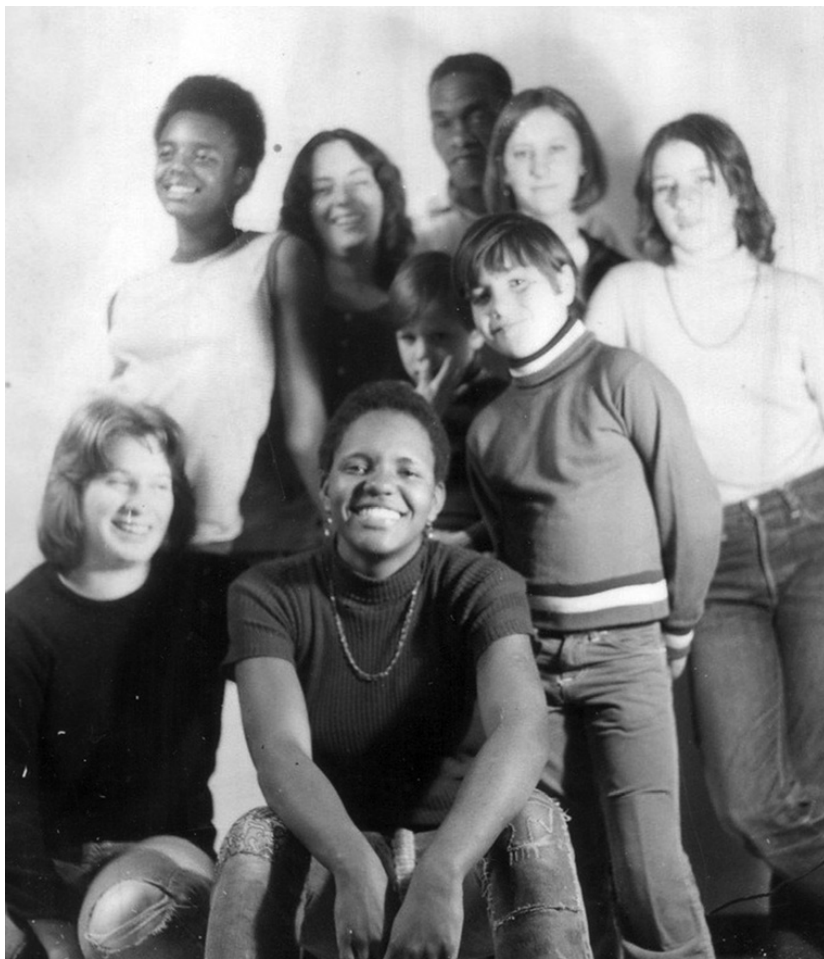
Figure 1 Children and young adults in Peoples Temple Redwood Valley branch, 1975.