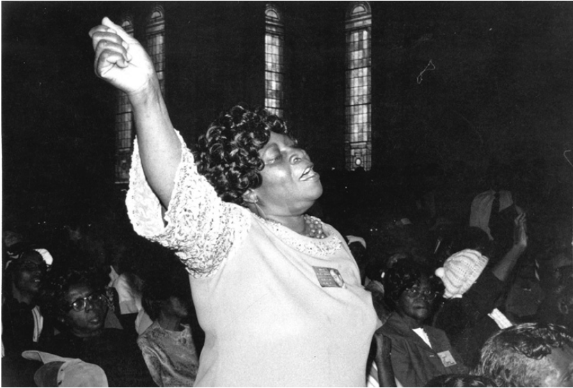
Figure 3 Woman in Los Angeles congregation of Peoples Temple, date unknown.

Ship Jesus – [and] brought back Blacks in chains, and he murdered people all over the whole world” (FBI Audiotape Q1035 1972). In this sermon and others, Jones pointed out all the instances in which the Bible advocates violence, slavery, and subjugation of women. He authored a pamphlet titled “The Letter Killeth,” typewritten sheets that list all of the errors, absurdities, atrocities, and inconsistencies in the Bible, though it also begins by noting the “great truths of the Bible” (J. Jones n.d.).