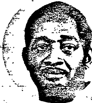
COMRADE PRIME MINISTER

Ministry of Education and Social Development