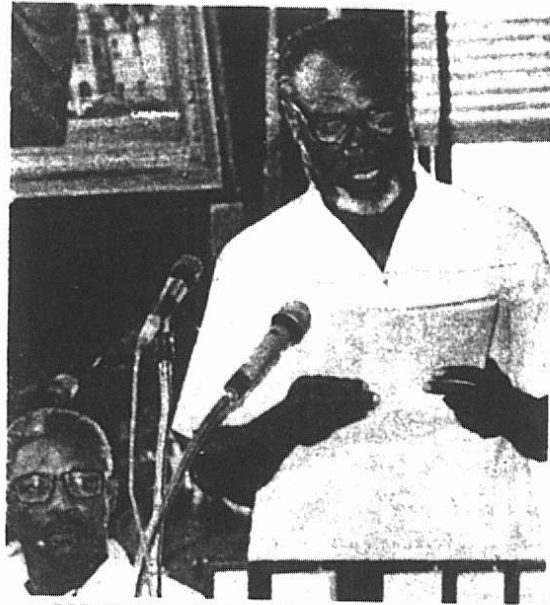
DEPUTY Prime Minister Cde. P.A. Reid reads out his statement in Parliament yesterday. On his right is Economic Development Minister Desmond Hoyte

GOVERNMENT recognises the "unprecedented magnitude" of the Jonestown tragedy and will continue to do everything possible to carry out its obvious responsibilities, Deputy Prime Minister, Dr. Ptolemy Reid has said: