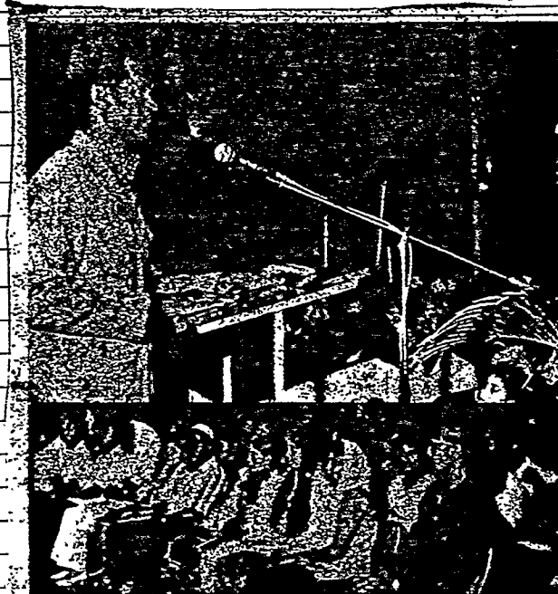
Minister Williams addresses Muslims at the Bangor. The function was sponsored by the United Arab Emirates Consulate.