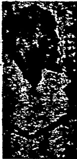
L. S. F. WILLS

FOREIGN and Justice Minister Wills were expected to leave the country later in the week for a visit to Cuba for important talks there with Cuban government officials.